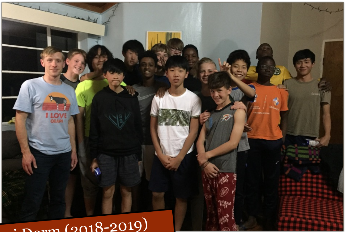
Okapi Dorm (2018-2019)