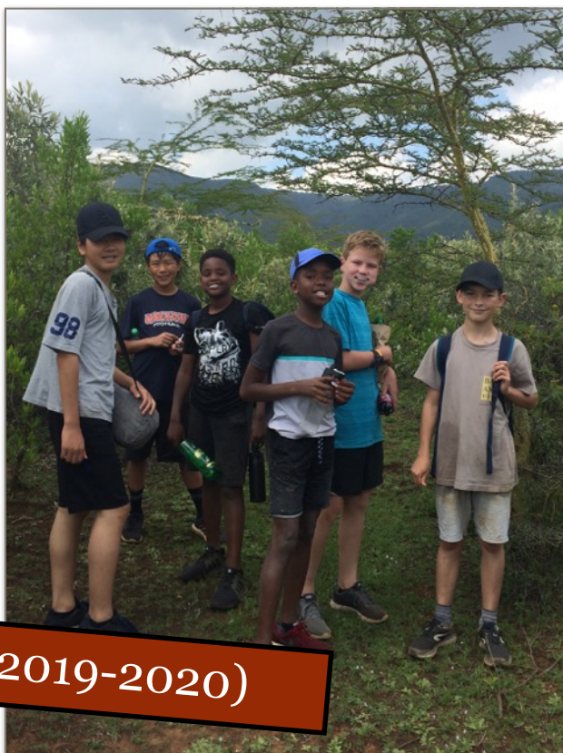
Okapi Dorm (2019-2020)

2019 was a time of goodbye (kwaheri) and welcome (karibu) for us in Okapi Dorm. After living with us for the last two years, our second group of dorm boys moved on to high school this past August (but we still get to see them and interact with them around campus), and we were blessed with a new group of 7th grade boys - our third since coming to RVA - who will now be with us until they move on to high school in two years!